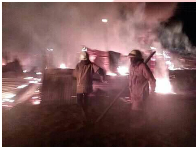
Fire Fighters working to put out the blaze